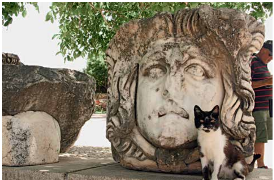
Medusa head in Aphrodisias Museum's garden