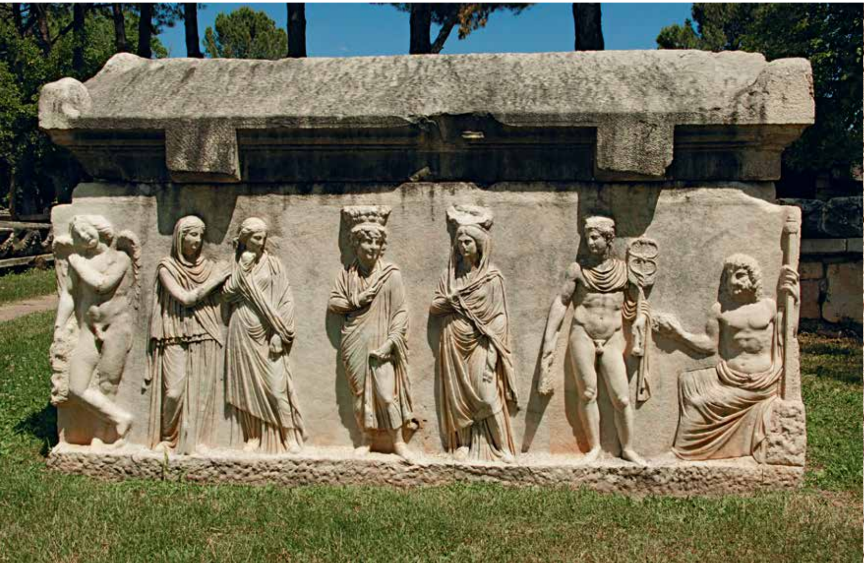
A sarcophagus in Aphrodisias Museum's garden

The wall ruins have been positively dated to the early phase of the temple and the remains of a mosaic floor date to the early 3 rd century B.C.; these ruins could possibly belong to a sekos with a peribolos plan. Existing evidence shows that this temple was the only monumental edifice in the area where the city of Aphrodisias was founded until the monumental city centre was built. It must be emphasized that the temple's