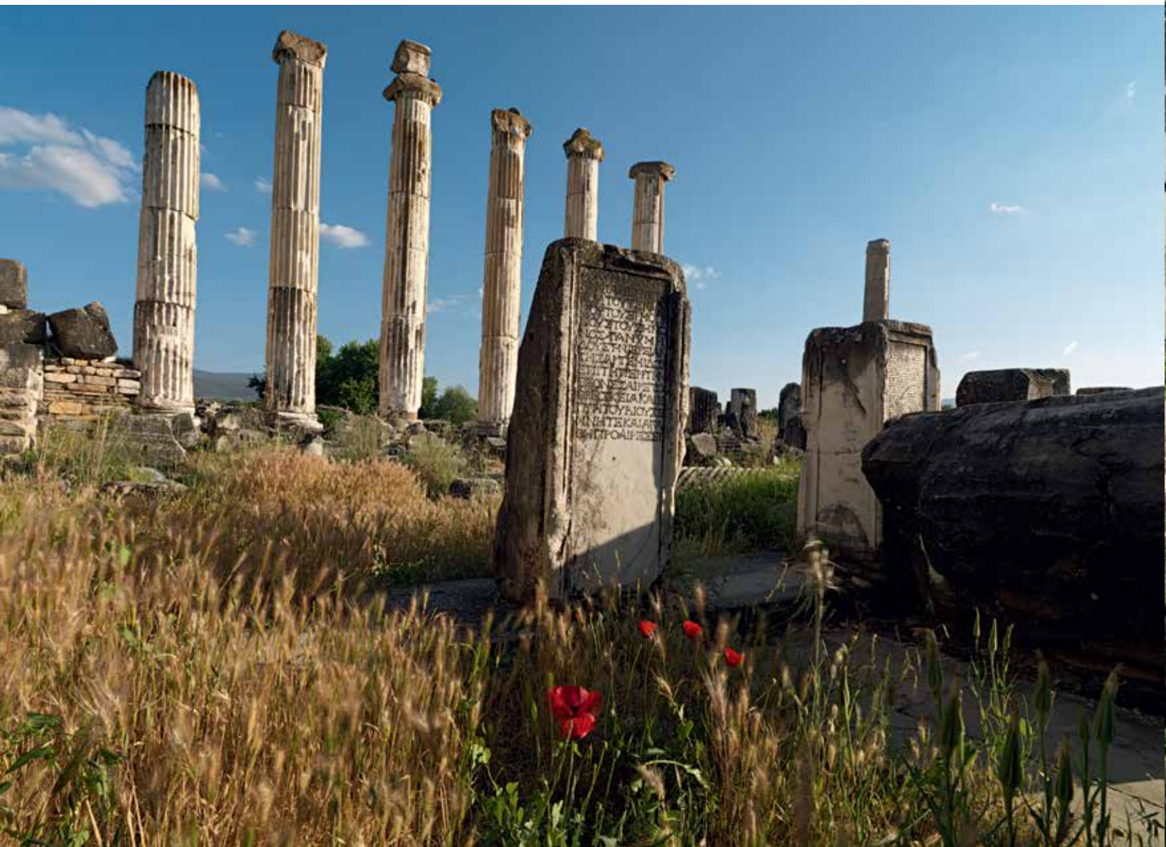
The Temple of Aphrodite

The city of Aphrodisias was founded in an area that has been populated since Prehistory. It is founded on top of two prehistoric settlement mounds (Theatre Hill and Pekmez Höyük) and covers an area of about 50 acres. The earliest pottery examples found here date back to the Neolithic Period but the earliest positively identified settlement on Pekmez Höyük dates to 2700-2600 B.C. Architectural remains and pottery fragments unearthed during excavations show that settlement continued here until 2200 B.C. The archaeological finds resemble the First Bronze Age pottery examples in Beycesultan in Denizli's Çivril district which is the most well documented prehistoric settlement in western Anatolia.